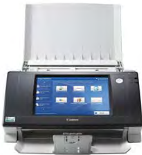
Canon ScanFront 300e Network Scanner

'Paper River is Civica's selected partner to provide fully integrated distributed scanning and capture from Multi-Function Devices and we have worked in conjunction with Paper River to develop their solution' - Civica